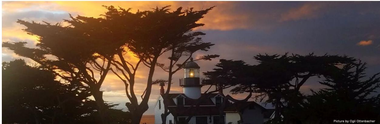
Point Pinos Lighthouse in Pacific Grove, the oldest continuously operating lighthouse on the west coast of the United States, lit in 1855.

By Tuesday, 3/12 , please RSVP to our next CE on Tuesday, 3/19 in Seaside